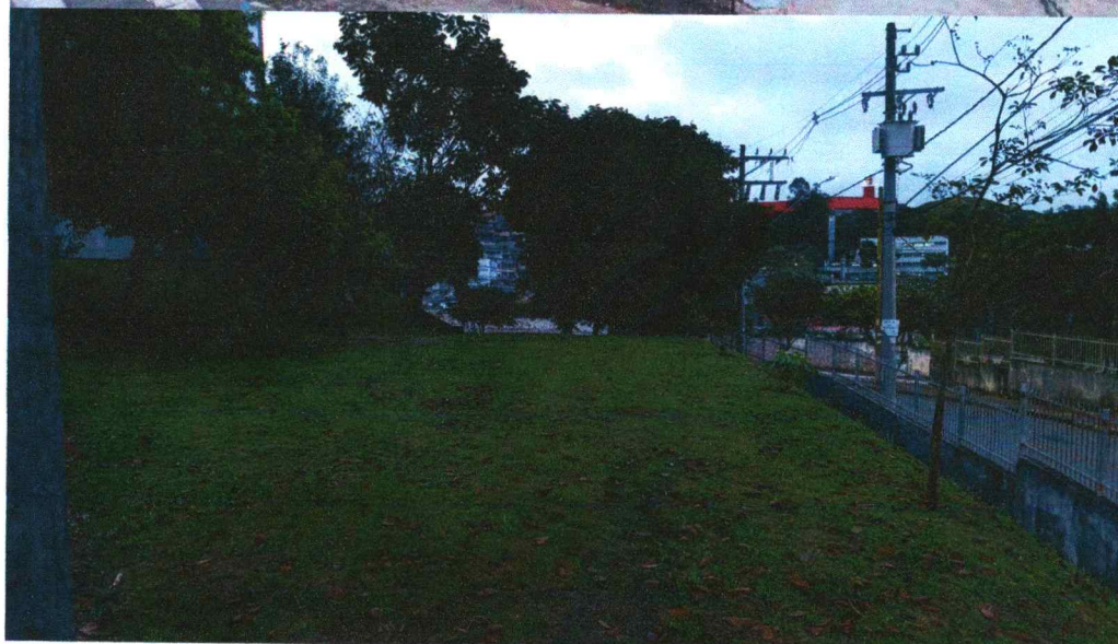
Avenida Anibal Correia, 1725, no bairro Parque Viana